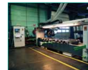
BIESSE ROVER 342 CNC machining center