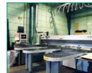
SELCO EB 95 saw (veneer/wood/plastic) 3,8 x 3,2 m x 80 mm with optimization